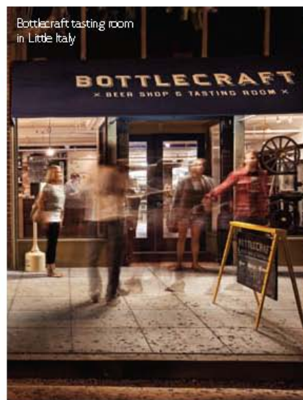
Bottlecraft tasting room in Little Italy

The revival of the once industrial area from Grape to Laurel Street has us singing like Sinatra. Take stock: Bottlecraft Beer Shop &